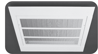
RFITF T-bar Ceiling Mount Trim (white only)