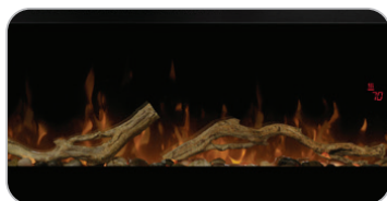
LF50DWS-KIT (Optional accessory) Driftwood and River Rock Accessory Package, Shown with the BLF5051