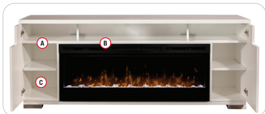
Alternative opening storage for media. *One adjustable shelf.