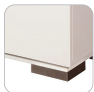
Sturdy metal legs