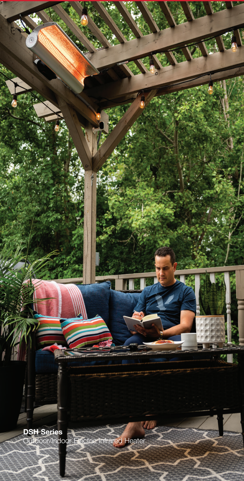
DSH Series Outdoor/Indoor Electric Infrared Heater

Likely the most common style for outdoor heaters, and most versatile for fuel sources offering natural gas or electric options. While install requires a professional, the heat output is greater, and often has more options for comfort with variable heat.