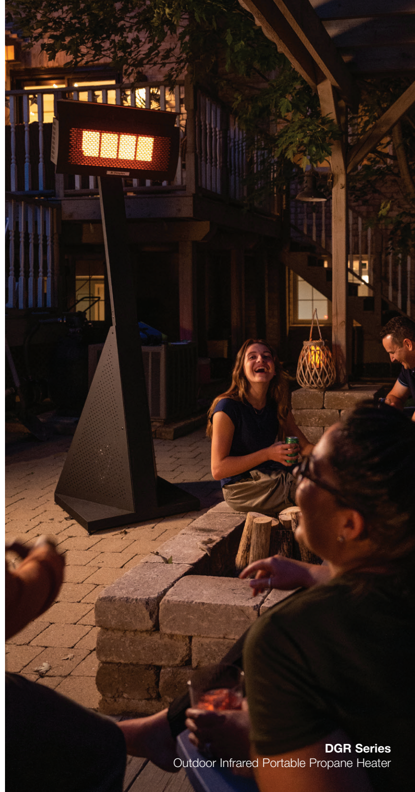
DGR Series Outdoor Infrared Portable Propane Heater

Portable or free standing heaters are often propane or electric sourced. Often, they will hide the propane tank and are excellent for moving between multiple entertaining spaces. Look for models with wheels and safety straps to make mobility easier.