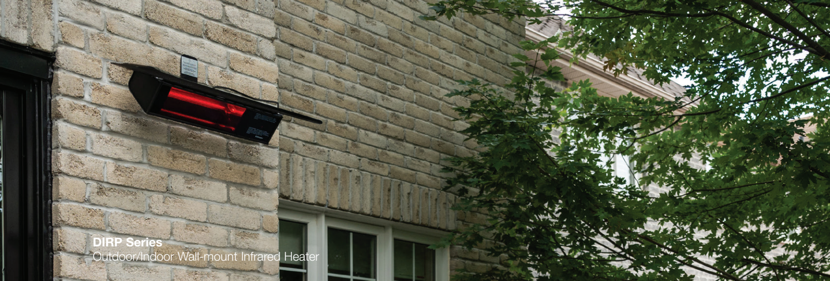
DIRP Series Outdoor/Indoor Wall-mount Infrared Heater