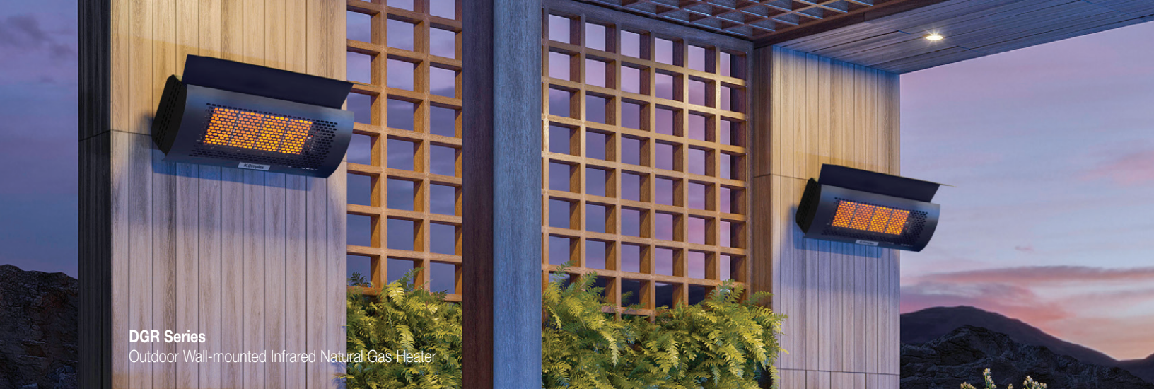
DGR Series Outdoor Wall-mounted Infrared Natural Gas Heater